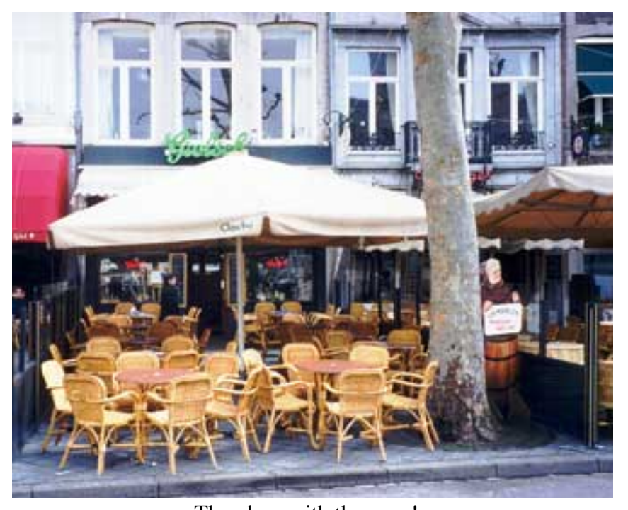
The place with the soup!

much difficulty. We toured the medieval walls, then went to the city center for that wonderful French onion soup. I had a beer with mine, a Grolsch "Lenten Dark" seasonal beer that was recommended by our waiter. It was very good, though I wondered why there would be a special beer for Lent. The soup was even better than I had remembered. While eating there, dad discovered that the toilet in back was special, so we all had to take turns going to the bathroom. It was self-cleaning. When you flushed, an arm would come down over the back of the toilet seat then the toilet seat would rotate while the arm deposited disinfectant. I guess