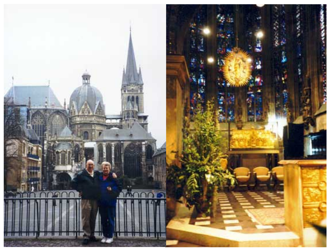
The folks at Charlemagne's chapel