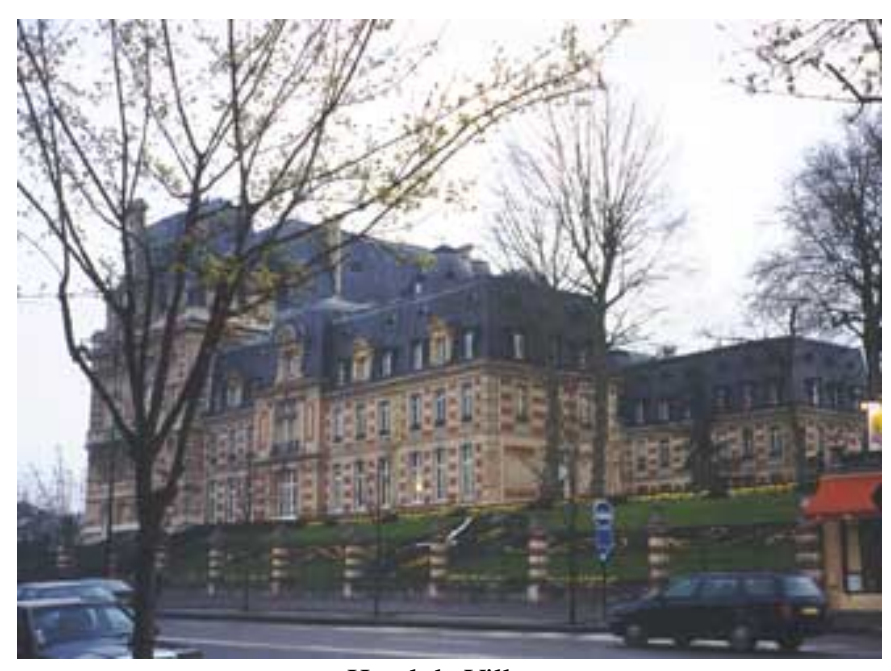
Hotel de Ville

I passed the Hôtel de Ville on the way to the RER. It looked just like the entry, clock and all, of