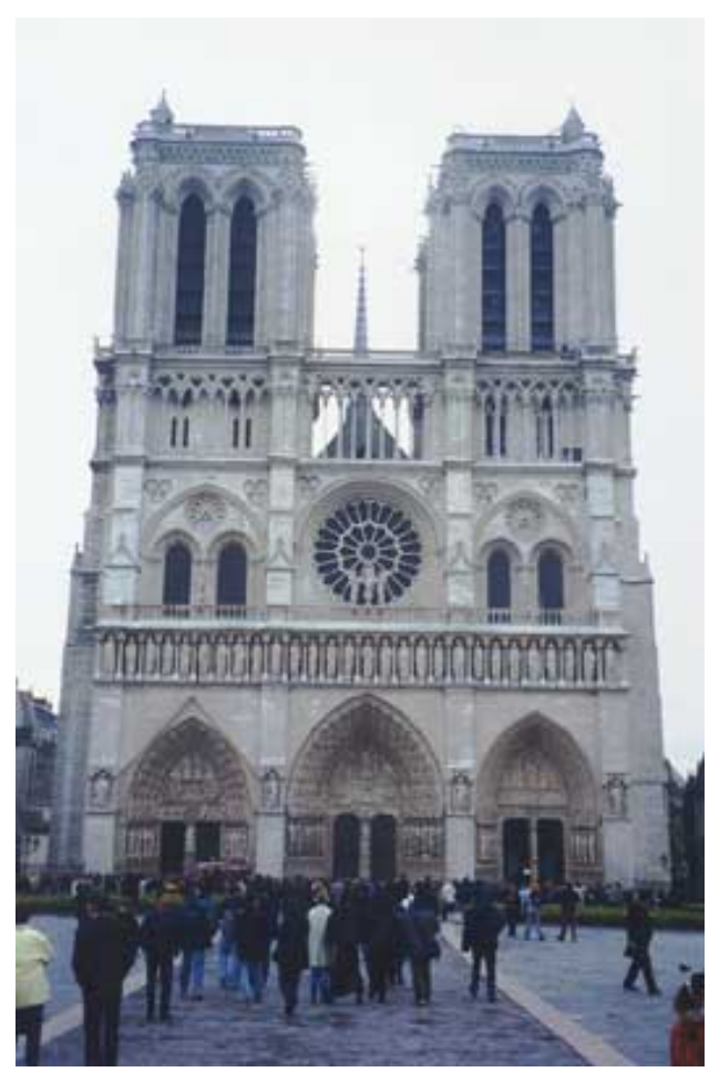
Notre Dame - with no scaffolding!

and took the metro to Gare du Nord. I noticed quite a few crazies on the train. There were a bunch yesterday. Maybe this is where Paris houses the insane, along with musicians and gypsies. When I got to Gare du Nord, I asked where I could stow my backpack. The info guy sent me to the wrong luggage check-in spot, so I walked a whole lot longer with my bags than I wanted to. Once I did find the place by track 3 (downstairs to the left), I was off to see the Cité. For once, Notre-Dame was unscaffolded. It looked great. I didn't get to see the apse like last time, when I had attended Mass, because they were now working on it. My knee hurt already, so no tower climbing. I instead went to S. Chapelle. S. Chapelle had been damaged by the wind storm so a section of the apse was being redone here too. It was still a fine place, and there were castles (for Castille) and fluer-du-lies (for Aragon) to remind