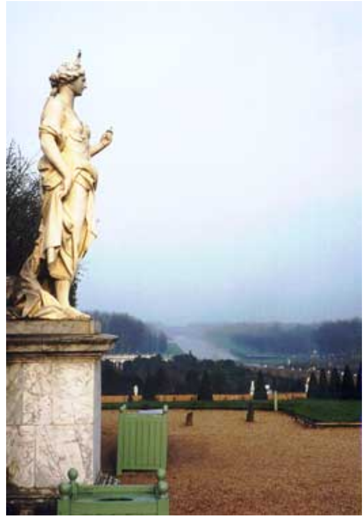
The garden at Versailles

Disneyland. Walt must have been here. I got to the RER station and, yes, there were lockers (about 12 in all), but they were full. I knew there was a bag and coat check at Versailles so I walked there. Wow, big cobblestones at the palace. Bags getting heavier. I checked my bag and began my tour of the gardens. From the fountain to the canal was under construction so I had to walk around. I went to the big residence (Louis' escape apartment where he stayed a few nights a week), then to Marie's small apartment. It was closed. The path to the temple of love and the Hamlet had "Danger - restricted access" signs posted everywhere. I took the road on the outside of the moat and still got some good pictures. I also got my shoes really muddy. I could see why it was closed; trees were down everywhere. I had seen a whole lot of trees down, all in the same direction, on the way here this morning. I then remembered reading about a fierce wind storm that had recently closed Versailles and knocked down trees in Paris. They were still cleaning up. On the way back, I walked through the grass to clean my