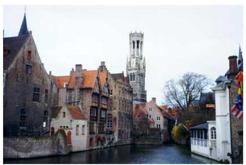
Brugge and its tower

(9%). The beer and the meal really helped with the weather outside where it was 38°/3°C with high winds.