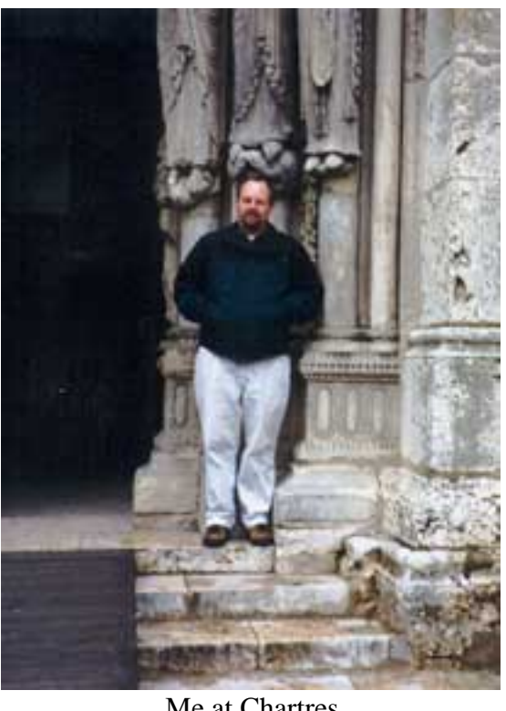
Me at Chartres

very amused beggar watched. I went in and shot some more. I took the crypt tour and shot even more, though my roll didn't load, oh well. I went back out and shot some more. It was now misting and cold (35°F). I had gone in earlier because I was shaking. Now my hands were so numb I could hardly change film. I talked to the beggar for a while (after he went to the TI an peed on it), then I went around the cathedral. I re-injured my knee on the north side. I took a picture of my beggar friend, and he of me, then I hobbled off. Twenty feet later, I felt a really big "snap" then almost passed out from the pain. I had really done it this time and I didn't even have aspirin with me. I was able to walk straight legged, but the knee refused to bend. I guess I was done at Chartres. I began to limp to my hotel. On the way, I found a French restaurant and had escargots, steak, cheese and cremé bruleé along with a very good Bordeaux (Les Gradines 1998). I figured that since I finished the cathedral early, I had time for a long sit-down French meal. The cremé bruleé was like a flan with a hard burnt sugar top. Yum! The chocolate that came with my espresso had an almond in the center and was dusted with powdered clove on top. New, weird, yum!