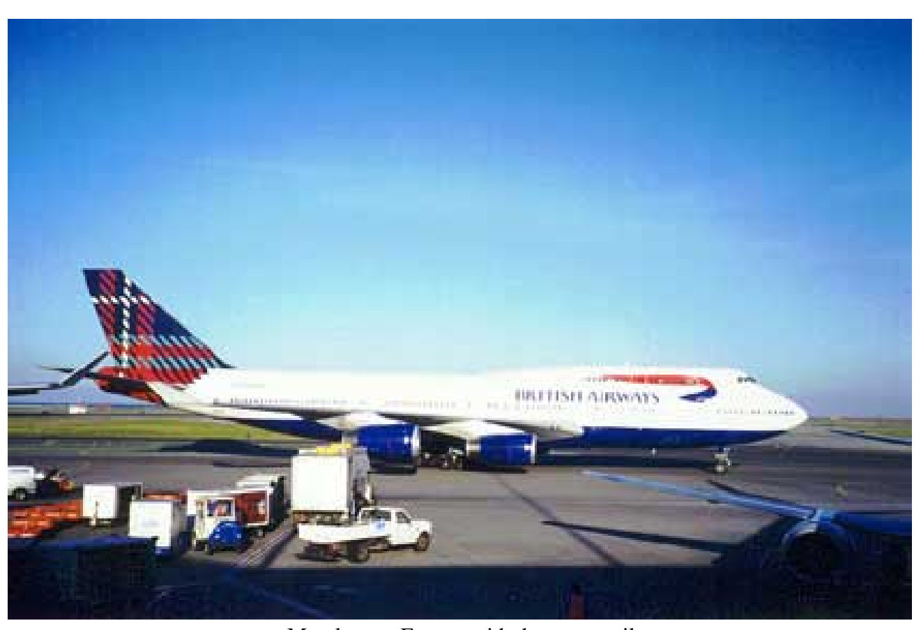
My plane to Europe with the pretty tail