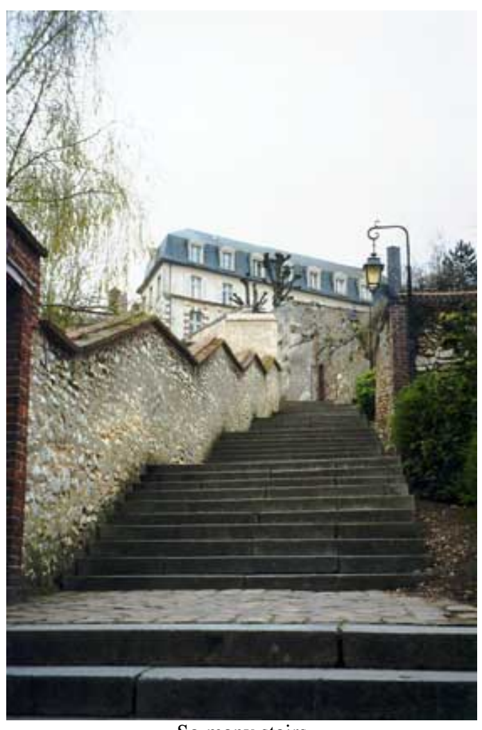
So many stairs

The second leg of my walking tour took me down a number of stairs by St. Agnus (very unimpressive) and by a pretty canal. I did not realize that the cathedral stood on a hill. St. Pierre was a much more impressive church at the bottom of the hill. The climb back up was very hard. I noticed on the way up that the city of Chartres used a very hard, shiny yellow quartz as their building material. I'll bet that's what this hill is made of.